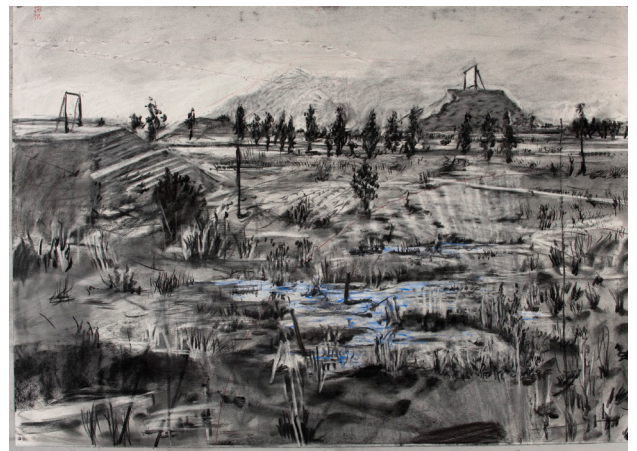
Drawing for Other Faces (Landscape with Two Mine Dumps) , 2011, charcoal and pastel paper.