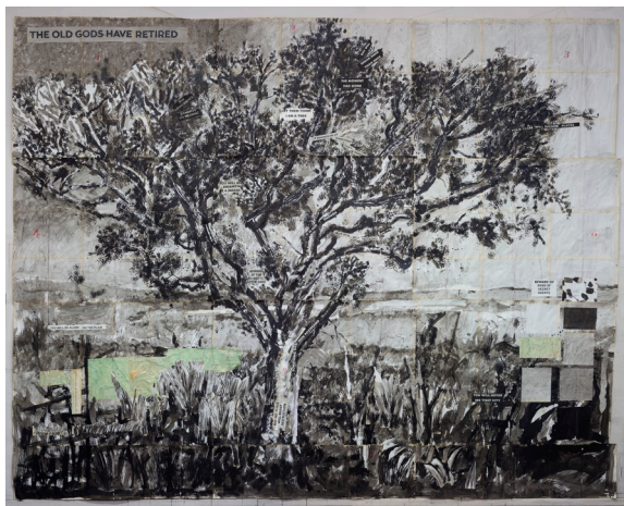
The Moment Has Gone , 2020, Indian ink, coloured pencil, digital print, found paper and collage on ledger paper.