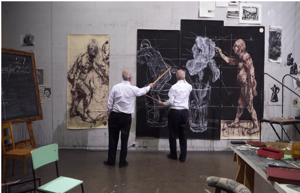
William Kentridge in his studio.