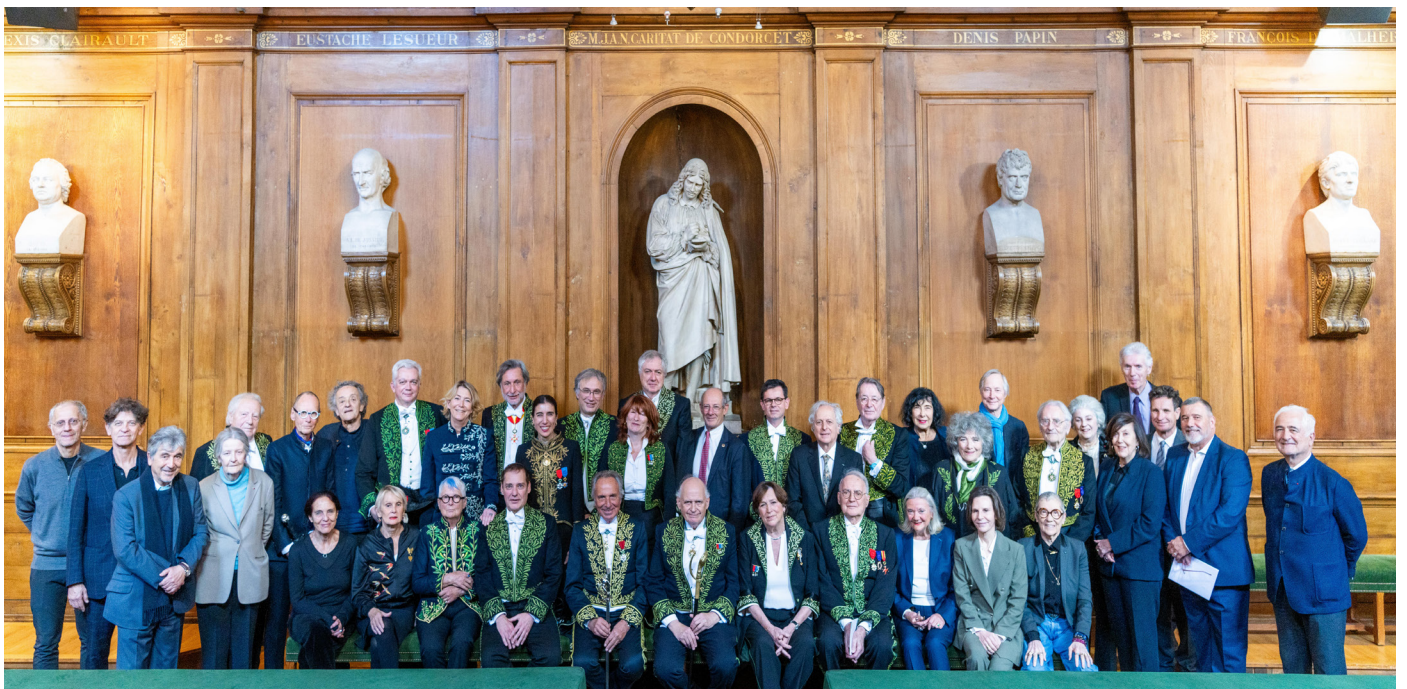
© E. Brane / Académie des beaux-arts