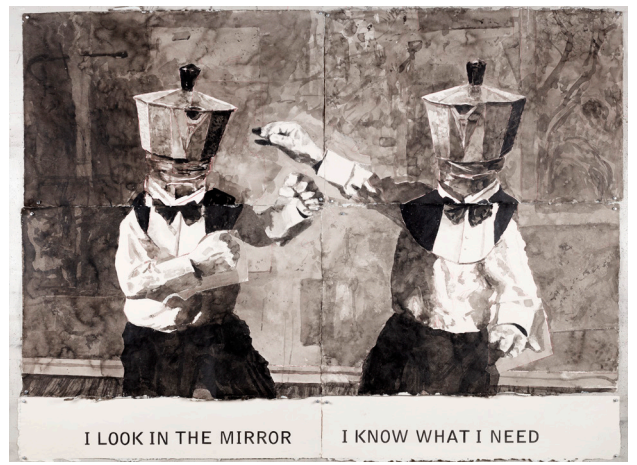
I Look in the Mirror, I Know What I Need , 2023, Indian ink and coloured pencil on Phumani handmade paper.